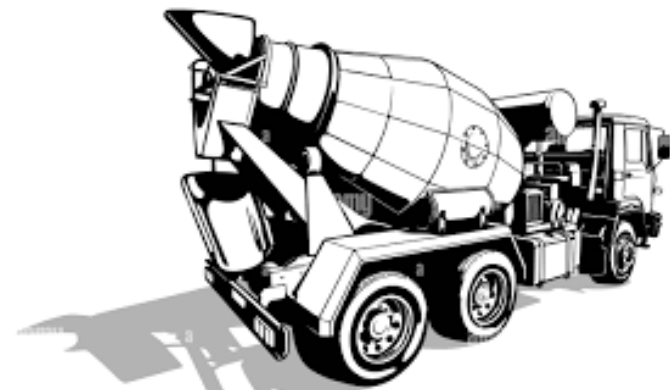
The concrete is mixing while the truck is driving along.