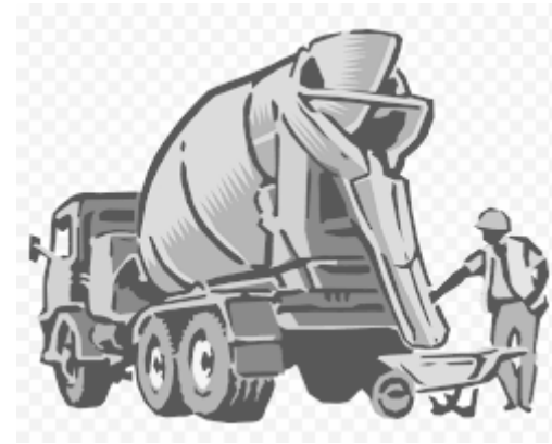
A mixer truck has a tank, mixing blades, a funnel and a chute.