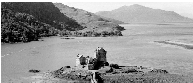
Loch Ness Monster