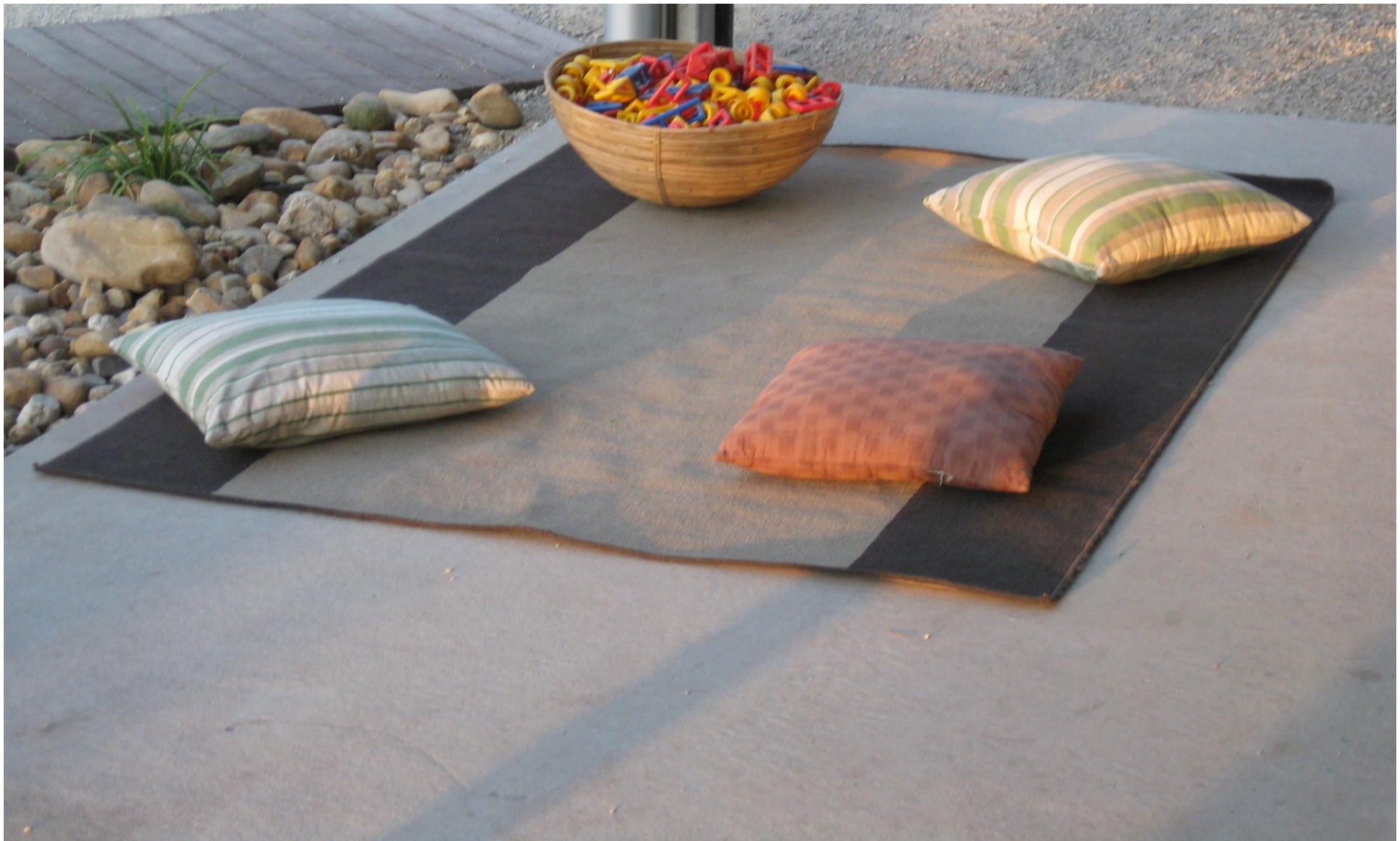
Cushions and a mat to create a play space