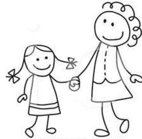
Au lomani tinaqu.