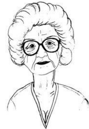
Au lomani buqu.