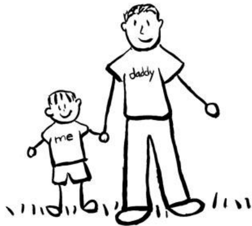
Au lomani tamaqu