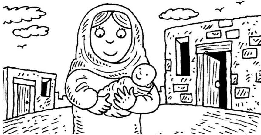
Sa sucu ko Jisu.