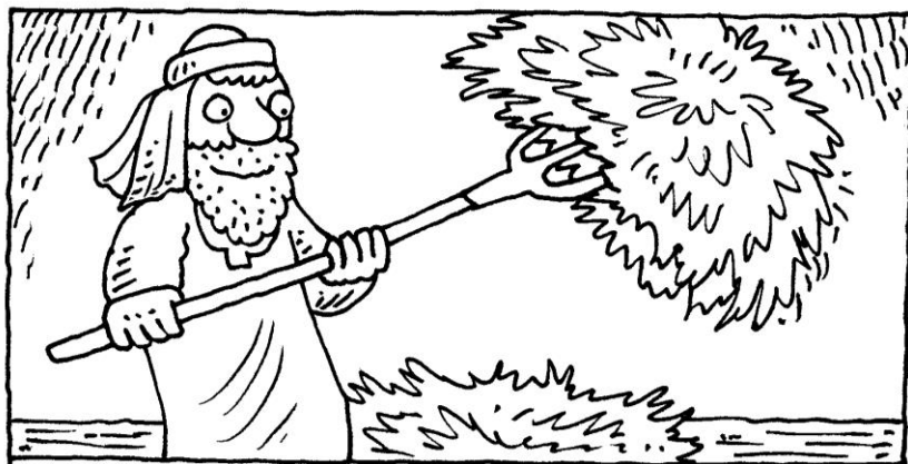
Oqo na co.