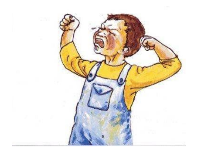
Do I cry or make a fuss?