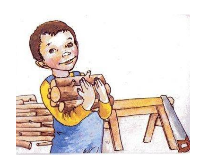
I am growing up.