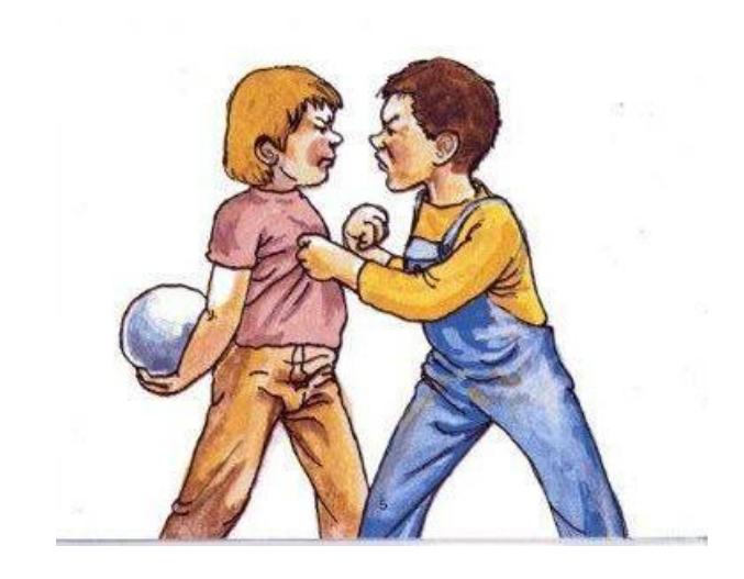
Do I hit or kick them?