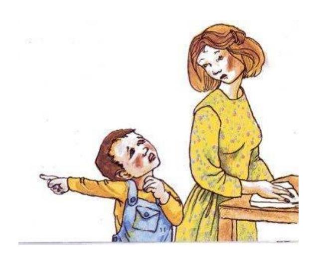
No. I find a big person to talk to. They tell me what is right.