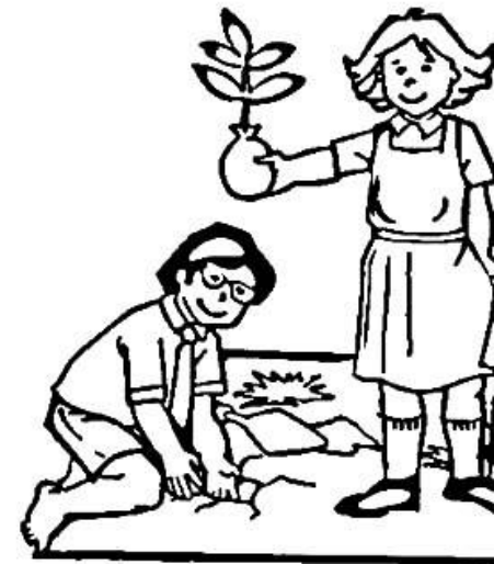
I am planting.