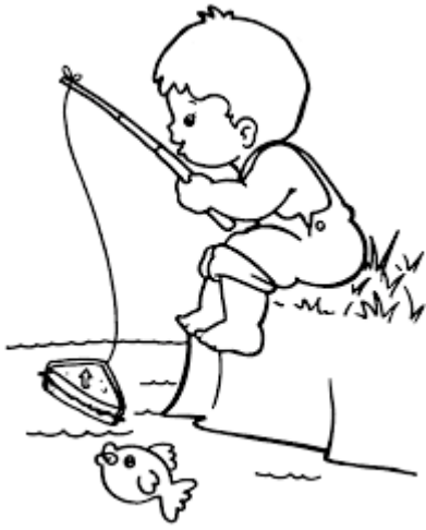
I am fishing.