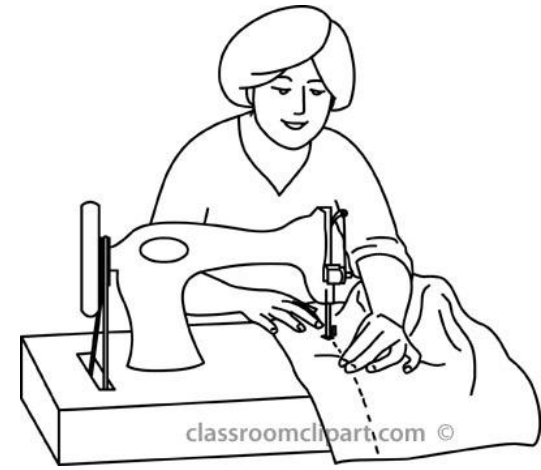
I am sewing.