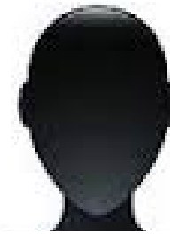
This is my head.