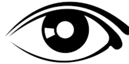
This is my eye.