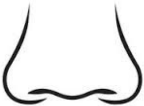
This is my nose.