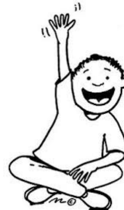
This is me.