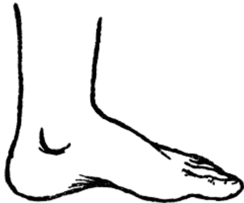
This is my foot.