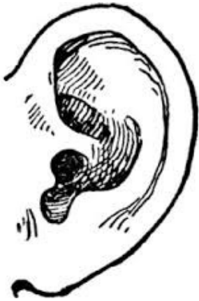
This is my ear.