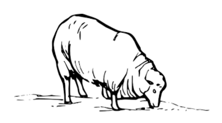
He finds grass for his sheep.