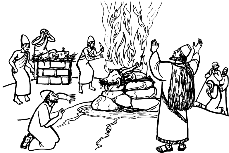
Elijah and the prophets of Baal